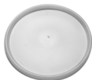
Dart® Translucent Vented Lid For 4J4, 4X4 Use with 4J4, 4X4.